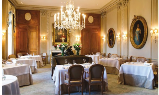
ROYAL REINS Above: Les Crayères, a Napoleon III chateau in the heart of Champagne, is a perfect spot to base yourself while enjoying the best of the region's wines – a visit to its Michelin-starred restaurant is an absolute must.