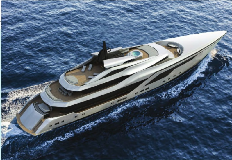
Left: ThirtyC's 60-metre motor yacht concept, named Ákos.

associated with running a company and the investment in securing new work and contracts, all while meeting our current clients' high expectations. On the other hand, these new challenges help to push you forward as an individual and a business, so they are very positive. We are free to be creative in our own way, have been able to expand our network and have broadened our scope of work in many aspects of the industry. To stay in the game, you can never miss a deadline and must always deliver; you have to be really dedicated and passionate.