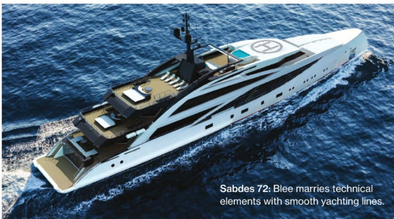
Sabdes 72: Blee marries technical elements with smooth yachting lines.