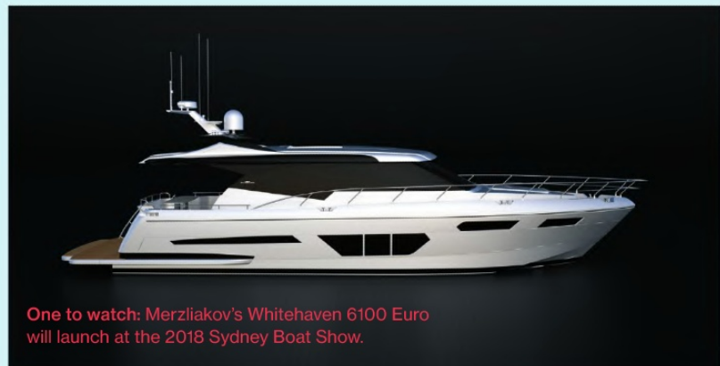
One to watch: Merzliakov's Whitehaven 6100 Euro will launch at the 2018 Sydney Boat Show.

Having a naval architecture background helps because you know straight away when something will not work, which saves time and money for everyone. I am able to kick a project off quite quickly by being able to carry out some preliminary feasibility analysis. It also helps steer a creative mind and keep it on course by using a systematic approach to projects and maintaining objectivity. After all, aside from creativity your project has to be built on time and on budget! mishamerzliakov.com